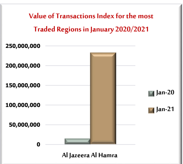
Figure (2) Figure (3)