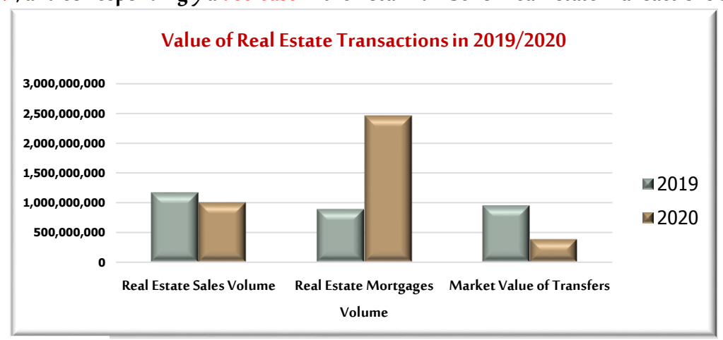
In Table No. (1), we notice an increase in the Total Value of Real Estate Transactions in 2020 compared to 2019 by 28%, and correspondingly a decrease in the Total Number of Real Estate Transactions by 21%.