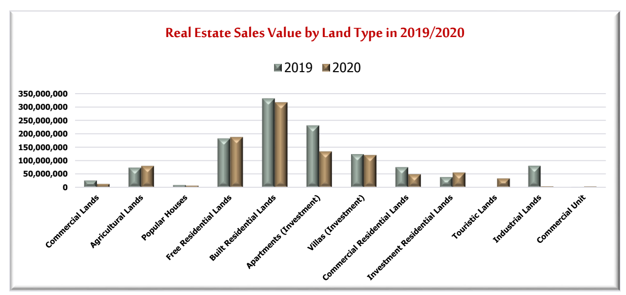
Figure No. (3)

We notice in Table No. (3) a sharp increase in Sales Value in 2020 compared to 2019 for Commercial Units by 65%, Investment Residential Lands by 44%, and a dramatic decrease in Sales Value in 2020 compared to 2019 for Industrial Lands by 95%.