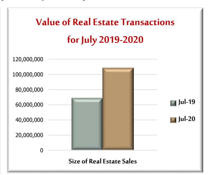
Figure 1 Figure 2