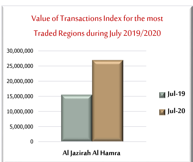
Figure 3 Figure 4