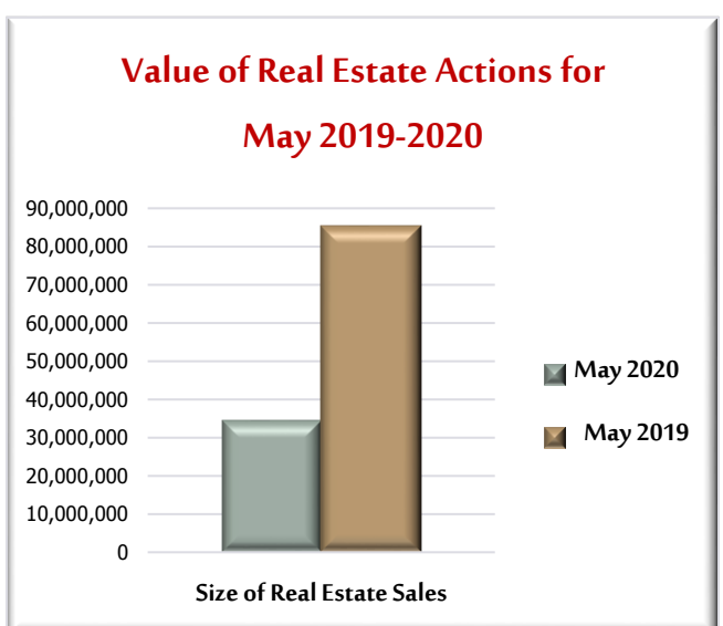
Figure 1 Figure 2