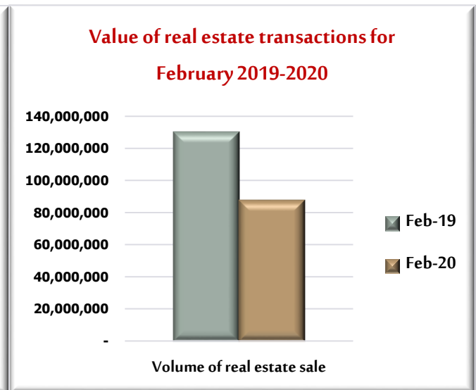
Figure (1) Figure (2)