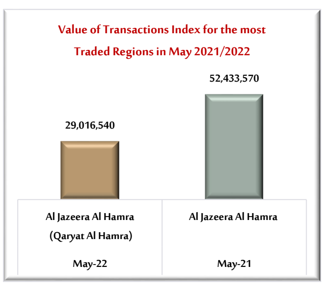
Figure (2) Figure (3)