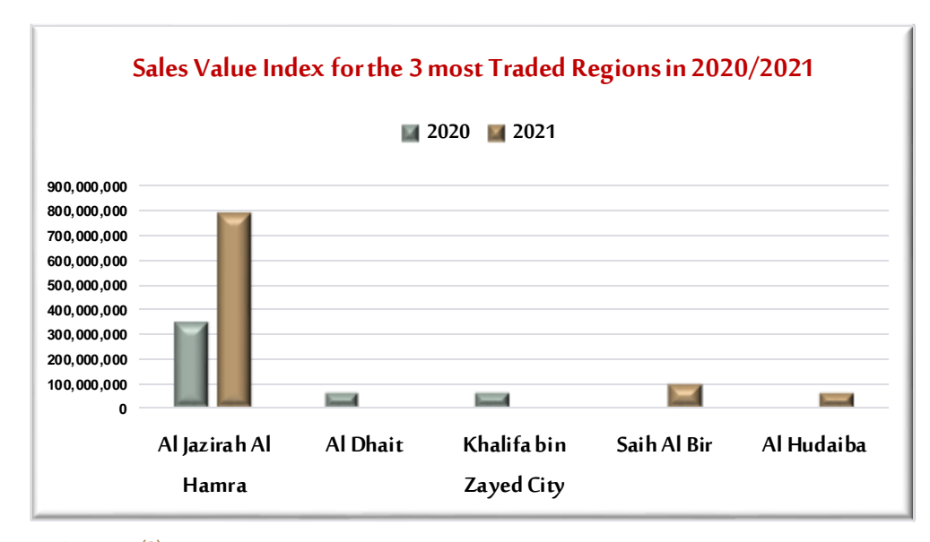
Figure No. (2)