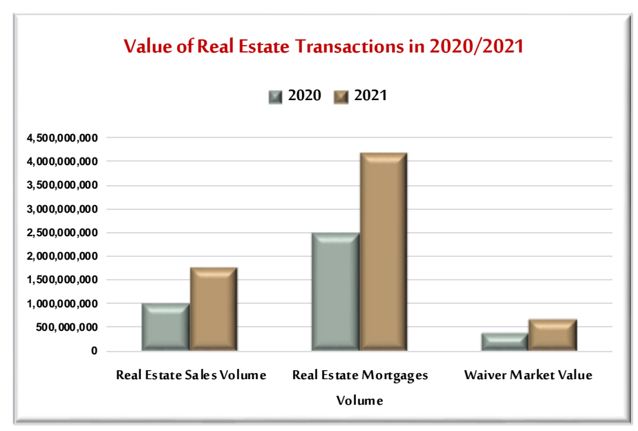
Figure No. (1)