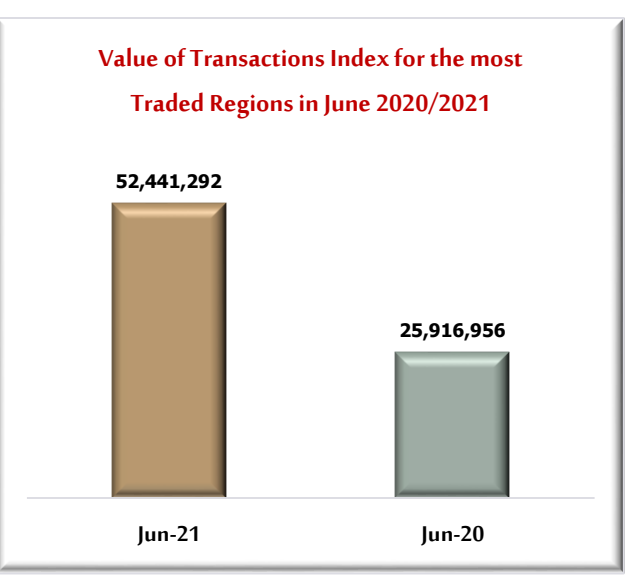
Figure (2) Figure (3)