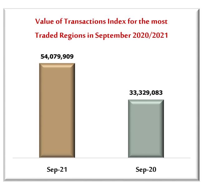
Figure (2) Figure (3)