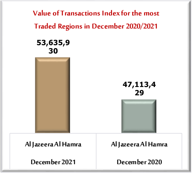
Figure (2) Figure (3)